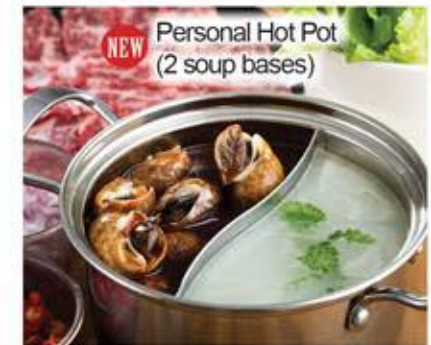
NEW Personal Hot Pot (2 soup bases)