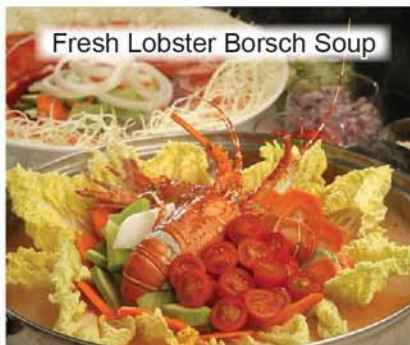
Fresh Lobster Borsch Soup