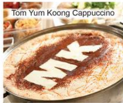
Tom Yum Koong Cappuccino