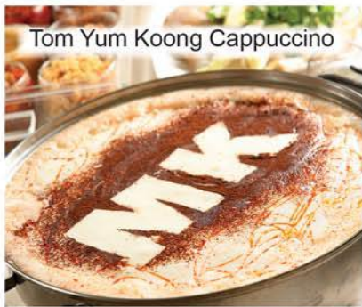
Tom Yum Koong Cappuccino