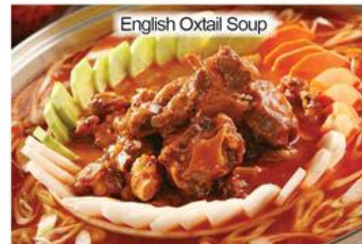
English Oxtail Soup