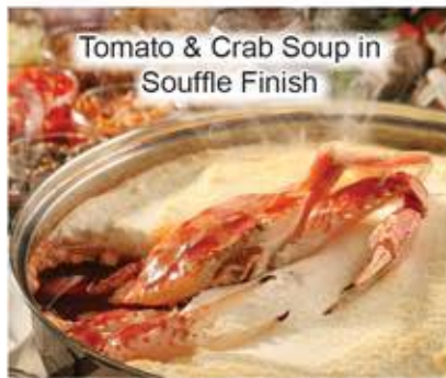
Tomato & Crab Soup in Souffle Finish