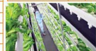
Hydroponic Vegetables are farm-to-table vegetables with no pesticides or GM.