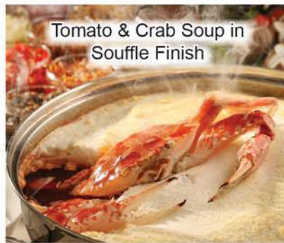
Tomato & Crab Soup in Souffle Finish