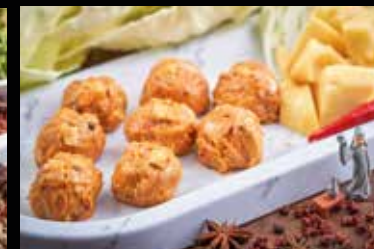
⑤ 回鍋豬肉丸 Sichuan Spicy Pork Balls