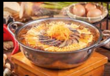
四川風味酸辣湯 Hot & Sour Soup Sichuan Style

營業時間：12:00 - 15:00 午市 | Lunch Opening hours 18:00 - 23:30 晚市 | Dinner