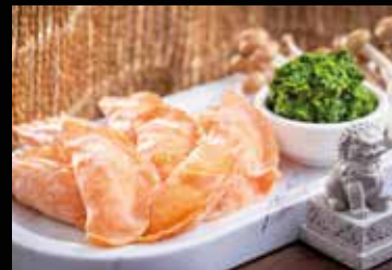
⑥ 薺菜香菇豬肉餃 Pork & Shepherd's Purse Dumplings with Marmoreal Mushrooms