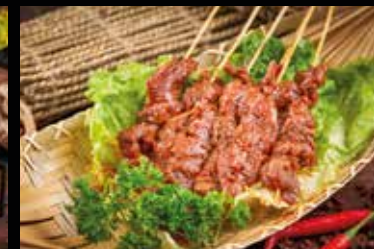
① 川味麻辣串串牛肉 Sichuan Mala Beef Skewer