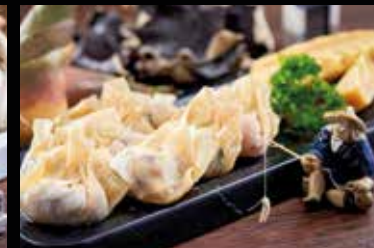
⑦ 竹筍木耳雞肉餃 Chicken Dumplings with Tree Fungus & Bamboo Shoot