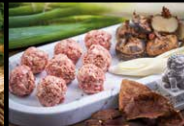
C 陳皮馬蹄京蔥 Beyond Meat 素牛丸 Beyond Meat Vegetarian Beef Balls with Dried Tangerine Peels, Water Chestnut & Leek