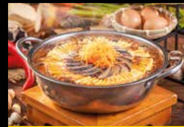
四川風味 素 酸辣湯 Vegetarian Hot & Sour Soup Sichuan Style

營業時間：12:00 - 15:00 午市 | Lunch Opening hours 18:00 - 23:30 晚市 | Dinner