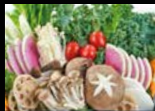
多色蔬菜拼盤 Assorted Vegetable Platter

以上套餐均包括四川風味酸辣湯及以下三款拼盤： Hotpot sets above include Hot & Sour Soup Sichuan Style and the 3 platters below :