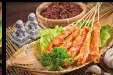
③ 川味麻辣串串雞肉 Sichuan Mala Chicken Skewer