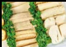
豆腐製品拼盤 Tofu Platter