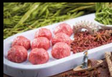
④ 麻辣檳菜釀牛丸 Mala Beef Balls with Dried Gong Choi