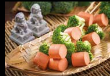
B 健美素廚師腸 素菜串燒 Vegetarian Sausage & Veggie Skewer