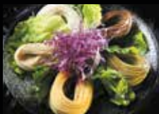
五式麵拼盤 Japanese Noodles Platter