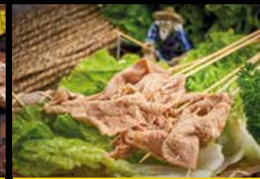
A 韓式串燒素牛肉片 Vegetarian Beef Skewer Korean Style