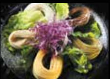
五式麵拼盤 Japanese Noodles Platter