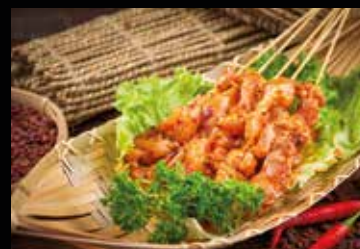
② 川味麻辣串串豬頸肉 Sichuan Mala Pork Shoulder Skewer