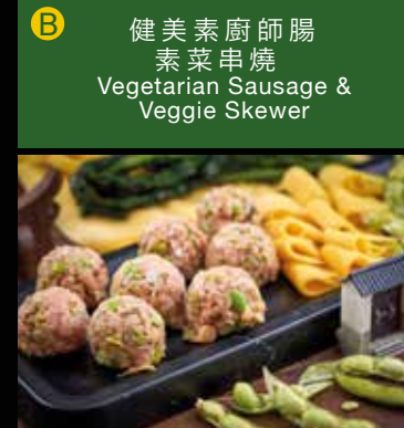
D 毛豆百頁 OmniPork 素豬肉丸 Omnipork Vegetarian Pork Balls with Green Peas, Beancurd Sheet & Snow Cabbage